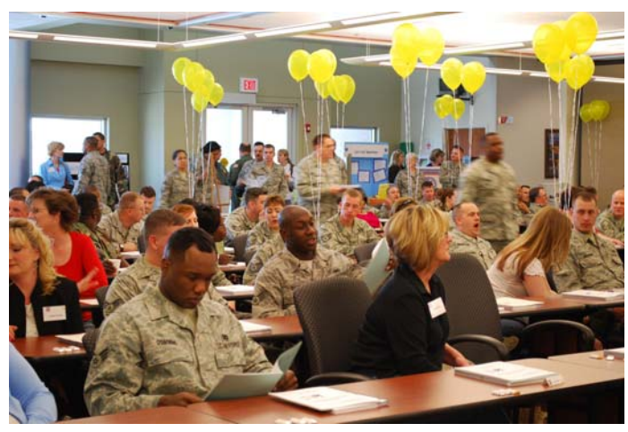
Unit members and spouses attended the yellow ribbon integration program on April 4.

ence. He gets stronger every day through his fiery, upbeat attitude, treatments and unwavering support of his friends and family.